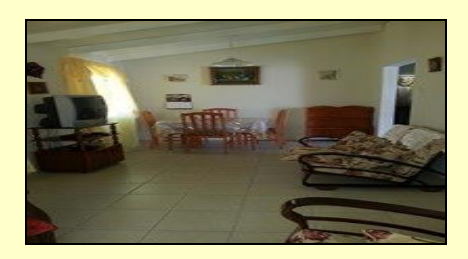
2 bedroom apartment.

Rate : $800 per room including utilities. Laundry and internet facilities available.