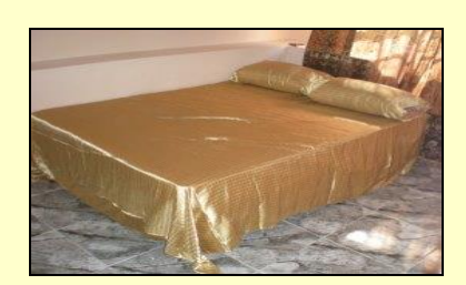
Two bedroom studio.

Rate : $700.00 per room including utilities. Laundry and internet facilities available.