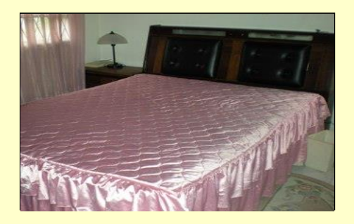
Three bedroom apartment.

Rates: $700.00 Master Bedroom $650.00 per room including utilities and internet. Laundry