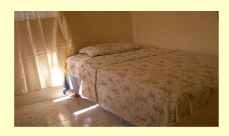
Two bedroom apartment.

Rate : $550.00 per room excluding utilities. Laundry and internet facilities available. <u>Prefers female students.</u>