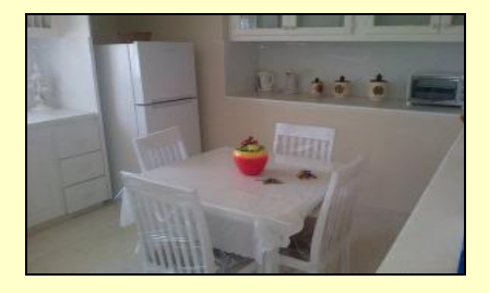
Mrs. Shirley Callender #2 Halls Village, St. James.

Rate : $1,000.00 including water, wireless internet. Laundry facility available.