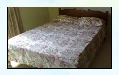
Two bedroom apartment Rate: $750.00 per room including utilities and laundry.