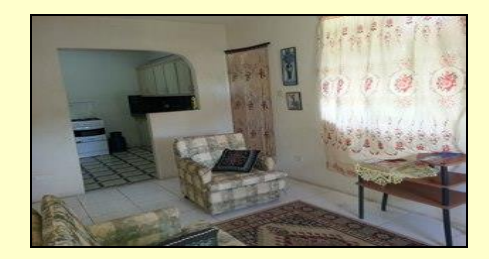
1 (1) bedroom apartment. - $850 1 (3) bedroom apartment including 1 master bedroom.

Rate: $600 per room and $700 for the master bedroom. Includes utilities. Laundry and internet facilities available.