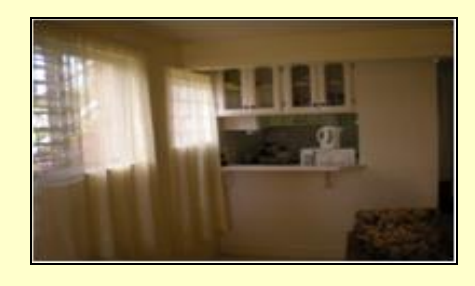
One (1) one-bedroom Apt. and one (1) Two-bedroom Apt.