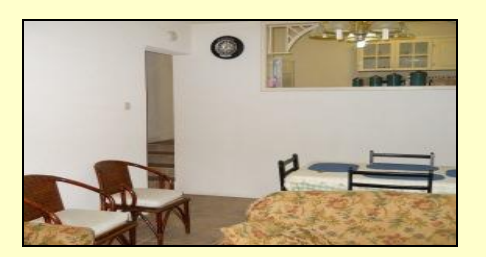
Two bedroom apartment.

Rate : $700.00 per room including internet, cable and water. Laundry