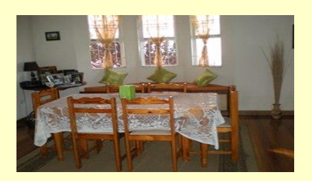
2 Bedroom apartment downstairs - Rate: $750.00 per room.