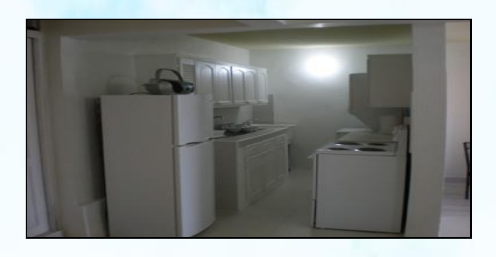
Fully furnished Two Bedroom Apartment

Rate: $650.00 per room including water, internet, laundry, electricity up to $200. Walk-in closet (1 bedroom)