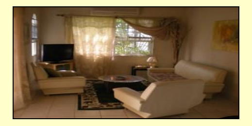
2 bedroom apartment. Rate : $675.00 per room (excluding electricity).

Laundry and internet facilities available.