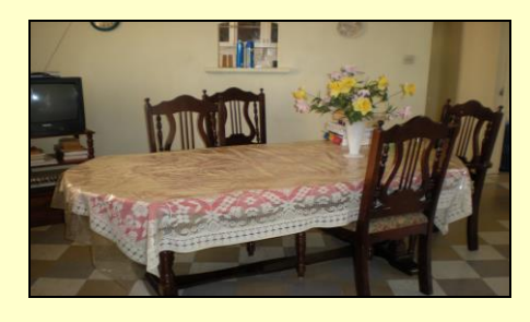
Three (3) bedroom house

Tel: (246) 426 8623 (H) Tel: (246) 265 3302 (C) eleendorson@hotmail.com