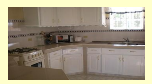
Two – two bedroom apartments. Rate : $750.00 per room including internet and water. Laundry facilities available.