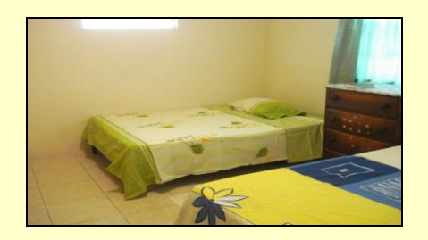
Rates: $600 each for double room $650.00 single room. Rates include wireless internet and utilities.

E-mail: <a href="mailto:bobgriffith1@hotmail.com">bobgriffith1@hotmail.com</a>