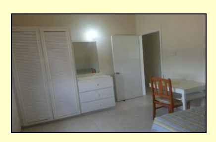
2 bedroom apartment.

Tel: (246) 424 6035 (H) NOTE : Is close to the UWI