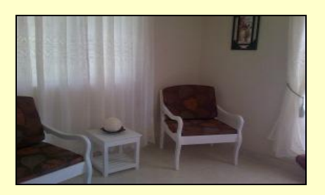
1 bedroom apartment.

Tel: (246) 824 1155 (C) (246) 428 4597 (H)