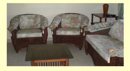
Two bedroom apartment.

Rate : $650.00 per room including internet, water and gas. Electricity excluded. Laundry facilities available.