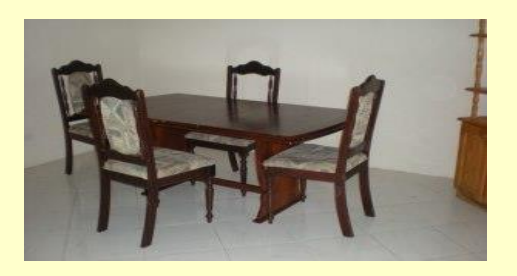
3 bedroom apartment and 1 studio.

Rate : $700.00 per room (excluding electricity). $800 for studio , incl. all utilities. Laundry, cable and internet