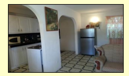
Ms. Heather Ashby #385 Independence Drive Husbands Gardens, St. James.

Rate: $600.00 per room. $650 master bedroom. Includes utilities with electricity to a maximum of $100.00 Laundry and internet facilities available.