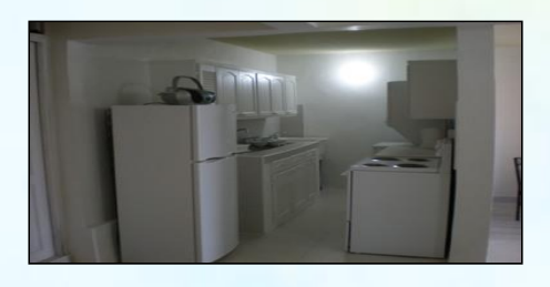
Fully furnished Two Bedroom Apartment

Rate: $650.00 per room including water, internet, laundry, electricity up to $200. Walk-in closet (1 bedroom)