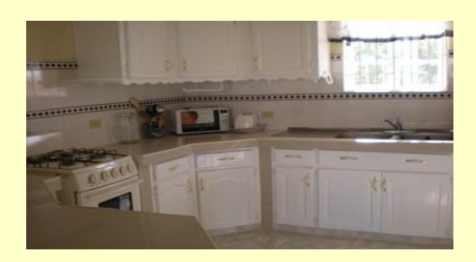
Two – two bedroom apartments. Rate : $750.00 per room including internet and water. Laundry facilities available.