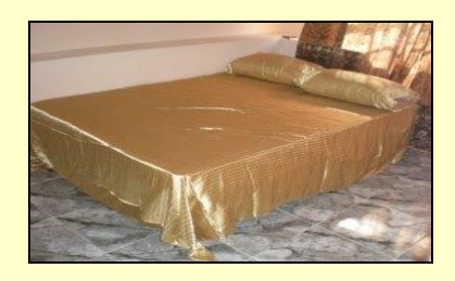
One bedroom studio apartment.

Rate : $900.00 including utilities and gas. Laundry and internet facilities available.