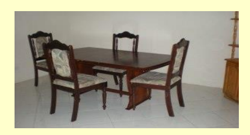
3 bedroom apartment and 1 studio.

Rate : $700.00 per room (excluding electricity). $800 for studio , incl. all utilities. Laundry, cable and internet