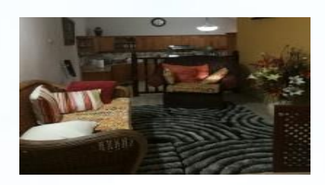
Studio apartments range between $850.00/$900.00.)