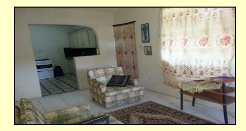
1 (1) bedroom apartment. - $8501 (3) bedroom apartment including 1 master bedroom.

Rate: $600 per room and $700 for the master bedroom. Includes utilities. Laundry and internet facilities available.