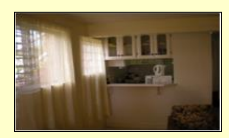
One (1) one-bedroom Apt. and one (1) Two-bedroom Apt.

Rates: $600.00 per room including utilities.