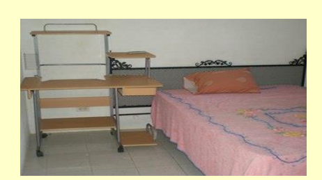
Four (2) bedroom apartments.

Rate : $750.00 per room including utilities. Laundry and internet facilities available.