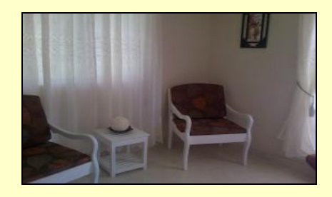
1 bedroom apartment.

Tel: (246) 824 1155 (C) (246) 428 4597 (H)