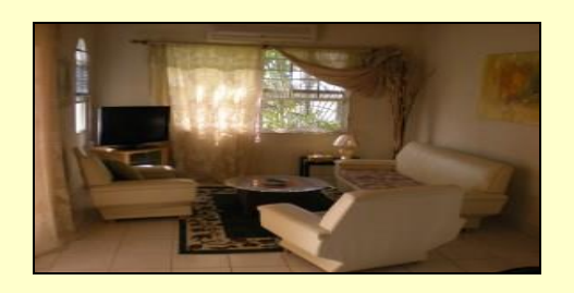
2 bedroom apartment. Rate : $675.00 per room (excluding electricity).

Laundry and internet facilities available.