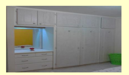
Two (2) bedroom air conditioned apartments. (Deposit required.)

Tel: (246) 432 1530 (H) Tel: (246) 234 5691 (C) <u>icarlylei@caribsurf.com</u>