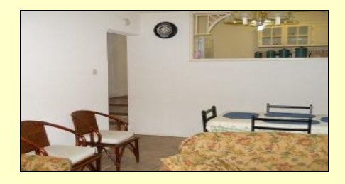
Two bedroom apartment.

Rate : $700.00 per room including internet, cable and water. Laundry facilities available.