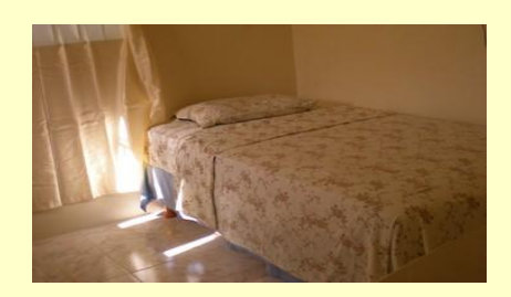
Two bedroom apartment.

Rate : $550.00 per room excluding utilities. Laundry and internet facilities available. Prefers female students.