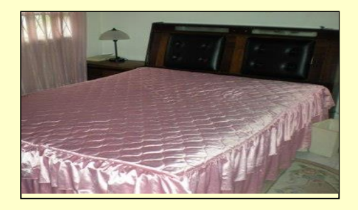
Three bedroom apartment.

Rates: $700.00 Master Bedroom $650.00 per room including utilities and internet. Laundry