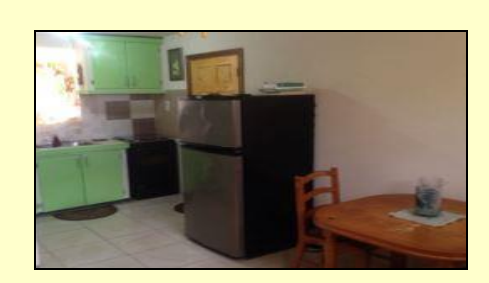
1 bedroom loft apartment with patio and security system. Approximately 5 minutes' walk from CIMH.

Tel: (246) 421 0697 (H) 231 7082 (C) E-mail: <a href="mailto:queen.maryj@hotmail.com">queen.maryj@hotmail.com</a>