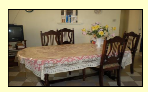
Three (3) bedroom house

Tel: (246) 426 8623 (H) Tel: (246) 265 3302 (C) eleendorson@hotmail.com