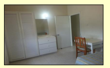
2 bedroom apartment.

Tel: (246) 424 6035 (H) NOTE : Is close to the UWI