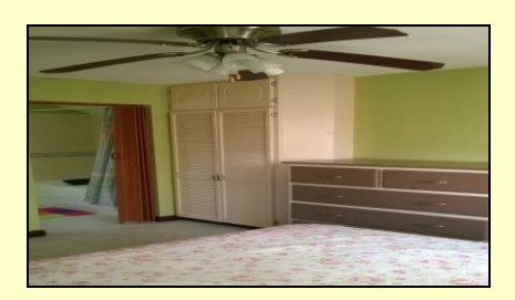
3 bedroom apartment including 1 master bedroom.

Rate: $800.00 per room. $900 Master bedroom. Includes utilities with electricity to a maximum of $100.00. Laundry and internet facilities available.