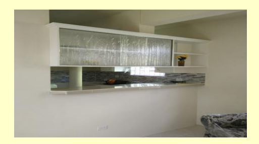
2 self-contained apartments - two bedrooms, 2 bathrooms. Rate: $900 per room (including utilities with electricity to $100.00).

Laundry and internet facilities available.