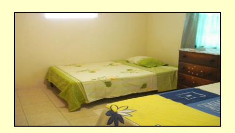
Rates: $600 each for double room $650.00 single room. Rates include wireless internet and utilities. Laundry and cable TV available

E-mail: <a href="mailto:bobgriffith1@hotmail.com">bobgriffith1@hotmail.com</a>