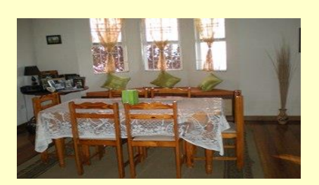
2 Bedroom apartment downstairs - Rate: $750.00 per room.