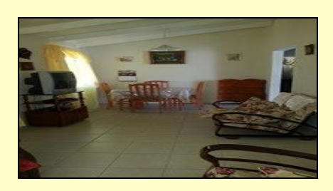
2 bedroom apartment.

Rate : $800 per room including utilities. Laundry and internet facilities available.